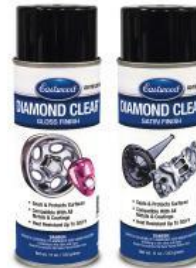
EW16105Z Diamond Clear Gloss Aerosol $