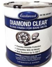
EW10357ZP Diamond Clear Gloss Quart For bare metal only $