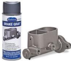
EW11756Z Brake Grey 13oz Aerosol $